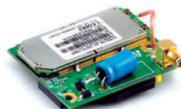
UMTS (3G) Module