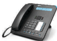
Digital Key Phones