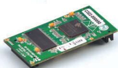
VoIP Server Module